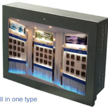
All in one type

Information Kiosk, POS, Mobile solution, Automation control